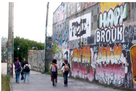
Section next to the metro lines (Astrabudua).

Throughout the course of the activity, actions were carried out combining thought and expression, not only past expression, but also analytical introspection, with which to seek, express and think about themes that interested the participants.