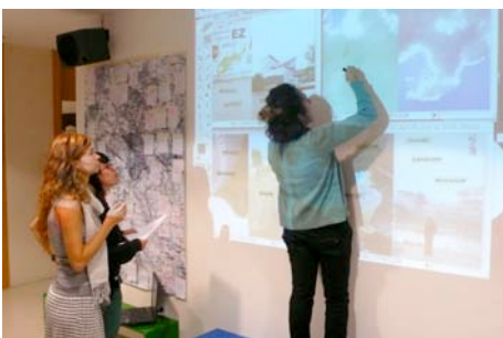
Providing form and content to the fanzine (Fine Arts Museum).

http://www.casitengo18.com/es/proyectos/derivefanzina_1/derivefanzina_02.html