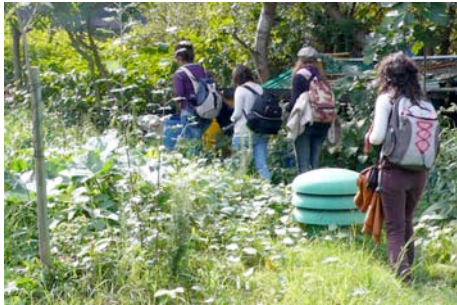
An area of unexpected fields (Getxo).

“You didn’t know what you would find when you turned a corner. Perhaps a field, a residential area, a factory... or you realised that it was a place you had been before but could not place on the map.”