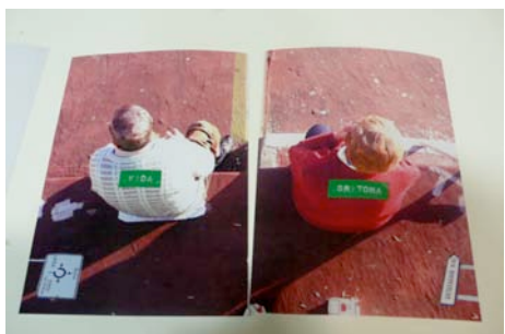
"Vida-Gritona", double page under construction.