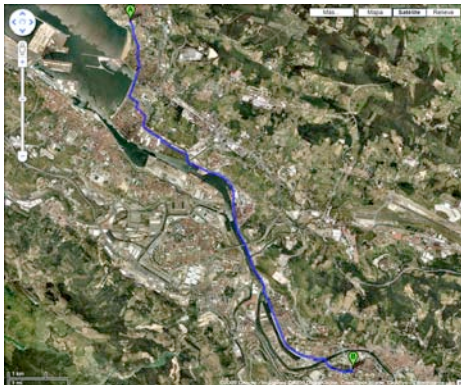
Route between Getxo – Fine Arts Museum (Google-map).

Very different urban situations, both privileged areas and rundown areas, very diverse cultural realities all mixed together... And all in a relatively small territory and with the constant sensation of rediscovering something, re-encountering or re-knowing places. Maybe because “whenever I passed this way, I never really noticed anything or stopped calmly to look”.