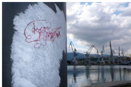
The tracks of the workshop at various route points (Axpe).

Dérive is a concept proposed mainly by the International Situationist. The word is French and literally means “drifting”, walking without a specific aim, usually in a city and following the will of the moment.