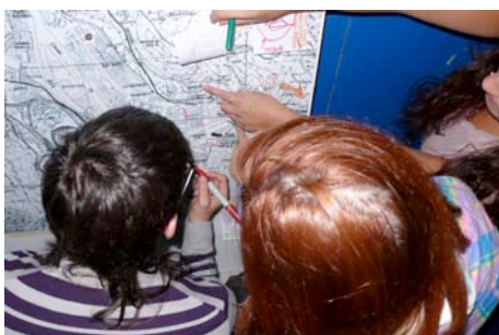
Initial identifications with the territory to analysis.

Very different urban situations, both privileged areas and rundown areas, very diverse cultural realities all mixed together... And all in a relatively small territory and with the constant sensation of rediscovering something, re-encountering or re-knowing places. Maybe because “whenever I passed this way, I never really noticed anything or stopped calmly to look”.