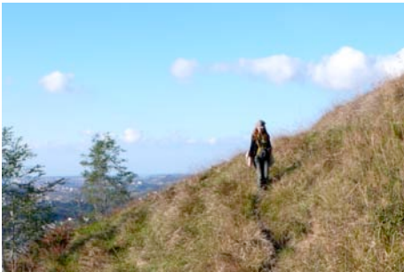
Panorama of the entire territory (Enekuri- Artxanda).

Initial session was two hours in the town of Getxo, acquainting the group members with each other and providing some key points to carry out the activity.