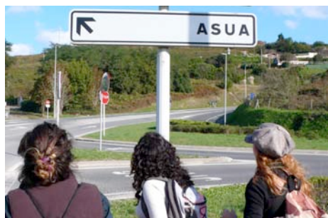
Time to make a decision (Enekuri).

A constant sensation of rediscovering something, re-encountering or re-knowing places. Maybe because “whenever I passed this way, I never really noticed anything or stopped calmly to look”.