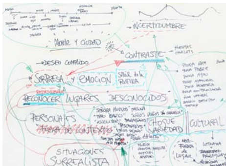
Outline of ideas with drifting experiences.

Surprise and contrast are the two main sensations experienced in the drifting.